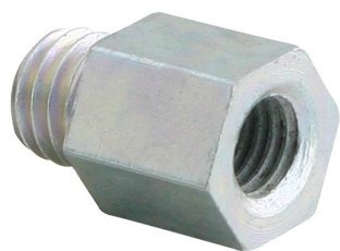
647 3 XXX